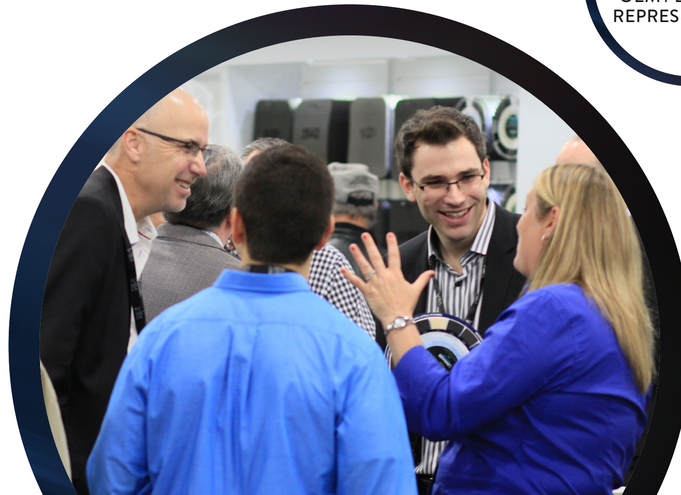
ABB Schweiz AG · AUDI AG · Akzo Nobel Powder Coatings GmbH · Alteo Alumina · Armacell GmbH · Avery Dennison · BorgWarner · Carl Zeiss Semiconductor Manufacturing Technology (SMT) GmbH · Daimler Truck · Ferrari SPA · Fischer Elektronik GmbH & Co. KG · Garrett Motion GmbH · Henkel AG & Co KG · Hyundai · Korea Aerospace Industries · MAHLE Powertrain GmbH · Mercedes-Benz AG · Panasonic Industry · Robert Bosch GmbH · Shin-Etsu Silicones Europe B.V. Germany branch · Toyota Boshoku · Vaillant GmbH · Valeo · Würth Elektronik